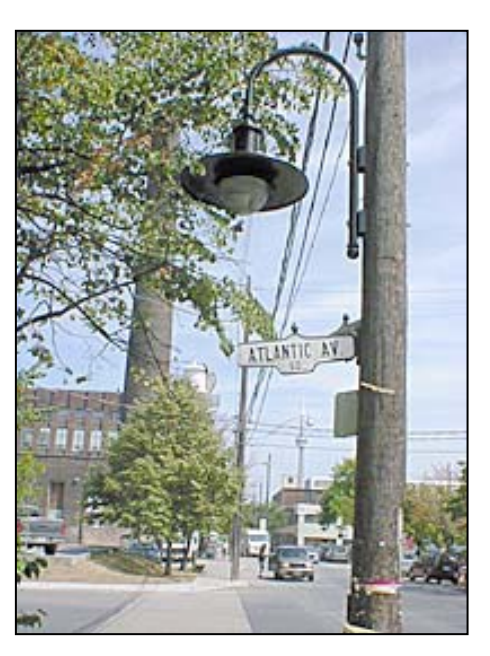
Luminaire added to existing utility pole

The lighting design process, as explained by a GE representative, is not typically a collaborative process. Municipalities state their goals and GE lighting designers apply a number of different software packages to develop a lighting design. GE is responsible only for the design, not for the determination of goals. They do not aid municipalities in understanding the community issues associated with a street lighting design. Often, municipalities desire lighting systems that minimize spill lighting (light pollution), but which do not meet IESNA standards.<sup>49</sup> While municipalities often have a specific lighting goal in mind,