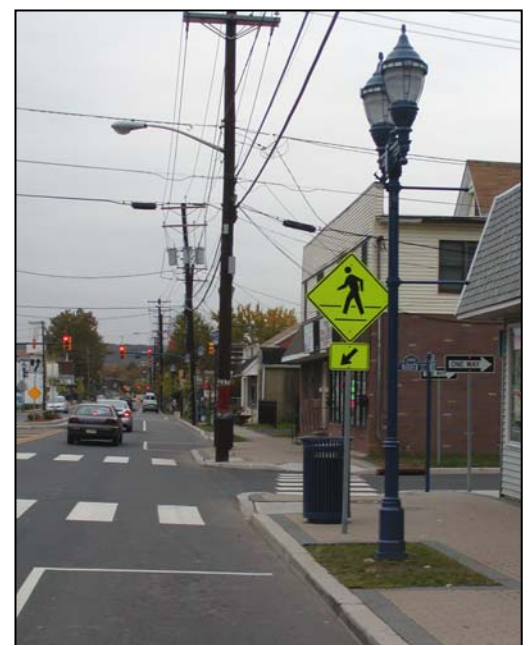
A mix of pedestrian lighting and street fixtures in South Bound Brook, NJ

The role of utilities is limited. When asked by a community, utilities such as Public Service Electric and Gas (PSE&G), can measure existing light levels. However, utilities will not define the desired light levels for a municipality and, as such, do not specify how roadway and pedestrian lighting should be provided. Moreover, utilities do not have their own set of pedestrian lighting guidelines, neither for pedestrian visibility by motorists nor for pedestrians to see their surroundings.<sup>47</sup> In general, municipalities through their ordinances define the outdoor light levels desired. Those levels vary; some communities want a lot of light, others want their streets to be more dimly lit.