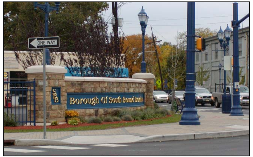
Pedestrian lighting improvement in South Bound Brook, NJ

talization plan. Part of this plan was to improve the Main Street streetscape, through traffic-calming measures, improved street lighting and other measures.