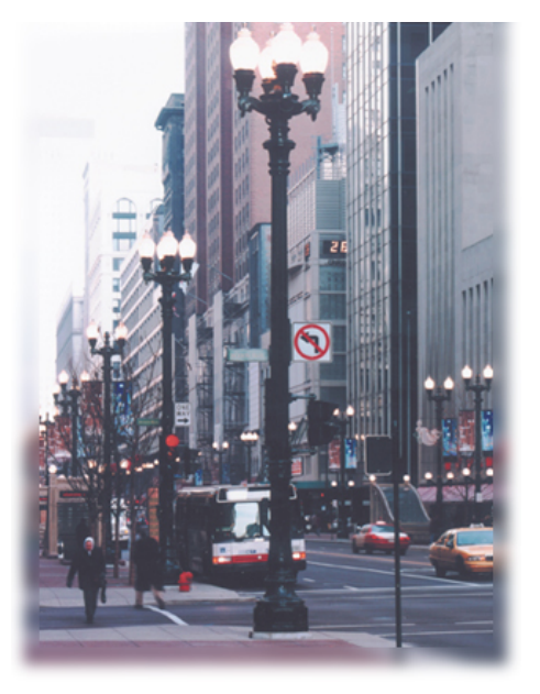
Functional historical lighting on State Street, Chicago, IL

Currently, standards for poles, arms, or luminaries for either functional or non-functional historic lighting, are not madated by the RDM. The RDM does not provide design guidance regarding these lighting types but does state that any lighting of this nature should avoid any potential glare, distraction, contrast, and visibility problem to both pedestrian and vehicular traffic.<sup>29</sup> In addition, the manual specifies that, " This lighting shall be placed as far off the edge of the highway as possible, behind the