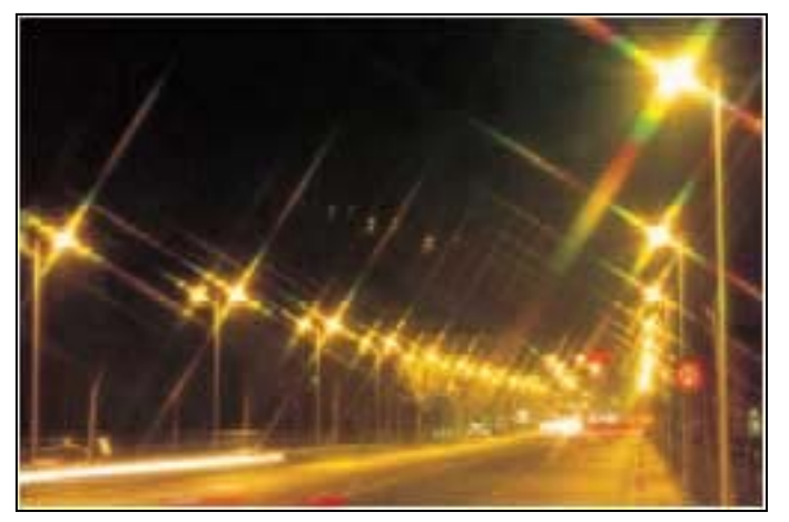
Too much lighting may fail to improve visibility

• Glare —an intense and blinding light that causes discomfort and results in a reduction in one's ability to see. Glare is some-