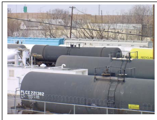
Figure 2. Example of carload rail traffic